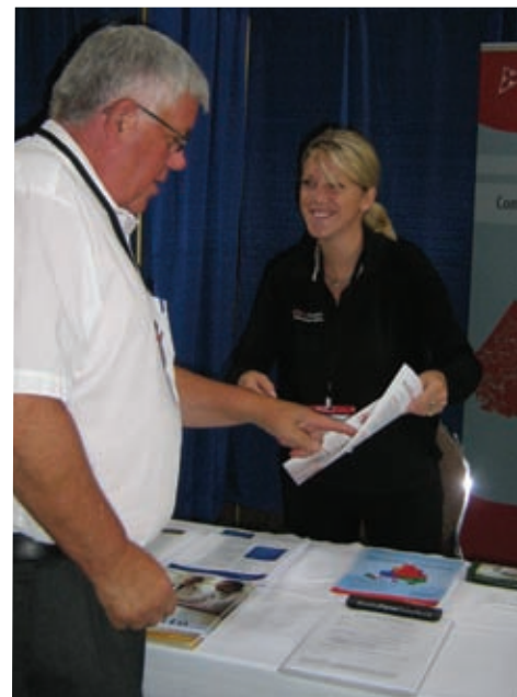
Ontario East Municipal Conference, Kingston, ON, September 2009

To view upcoming events, please visit www.HealthForceOntario.ca/events