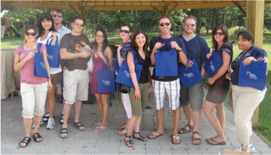
Fashion accessory: The co-chief residents in family medicine at the University of Western Ontario made it a goal this year to better integrate the rural/regional residents at social and academic events. This photo was taken at an event in the Windsor/Pelee region, where UWO residents met with their counterparts from the University of Windsor. HFO MRA provided small financial sponsorship to help cover the cost for food for the day as well as the blue-coloured bags.

“The NorWest CHCs-Longlac site in the small community of Longlac has been put on the radar for physicians looking for employment opportunities and is successfully competing with larger NW Ontario communities for physicians. This is due to HFO MRA’s marketing success in making family medicine residents aware to register with HFOJobs as the best one-stop location to look for work in the province.”